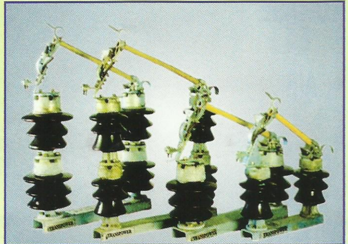
Drop Out Fuse

TRANSPOWER® Indian made out door, offload Triple Pole, Gang Operated Switch Tilting/Rotating type, Single/Double break consisting of hot dip galvanized channel iron base, Original post type H.T. insulators, Copper or Copper alloy high pressure heavily tinned contacts, plated mild steel orcing horns capable of breaking the magnetizing current complete with horizontal connecting bar G.I. pipe as down rod levers, couplings and operating handle with locking arrangements in voltages upto and including 33 KV line Switchyard and current upto and including 1600 Amps manufactured as per IS 9921 & 1818.