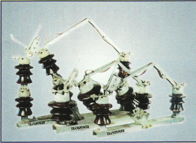
Single Break Isolator Tilting Type