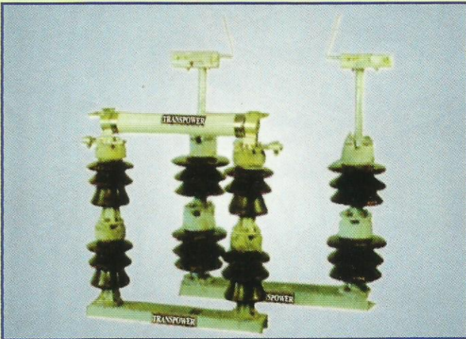
HT. HRC with Mount & Horn Gap Fuse

TRANSPOWER® Indian made Drop out lift off Fuse link consisting of channel iron base two single stack insulators per phase complete with fuse carrier bekelite tube with heavily tinned nonferrous metal parts and spring loaded phosphor bronze contact complete, without fuse element in voltages upto and including 33 KV as per IS 9385 / IS 5792 & BS 2692.