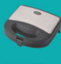
SANDWICH MAKER 1.8L QUBA