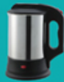
ELECTRIC KETTLE 1.5L 1700W