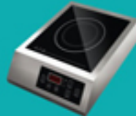
INDUCTION COOKTOP 2000W QUBA