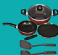
COOKWARE SET 1.8L QUBA