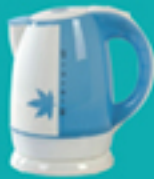
ELECTRIC KETTLE 1.8L 1700W