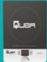
INDUCTION COOKTOP 2000W QUBA