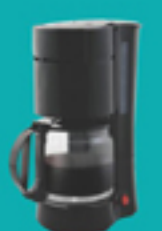
COFFEE MAKER 817W QUBA