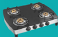
BURNER COOK GAS 4 Burner 21000BTU/hr