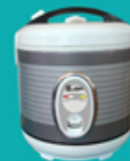
RICE COOKER 1.8L QUBA