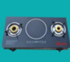
GAS COOKTOP 2000W QUBA