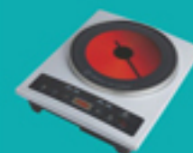
INDUCTION COOKTOP 2000W QUBA