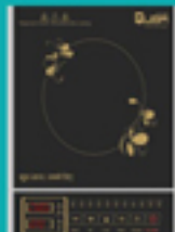
INDUCTION COOKTOP 2000W QUBA