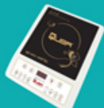
INDUCTION COOKTOP 2000W QUBA