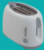
TOASTER 850W QUBA