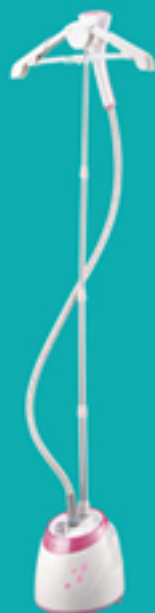
STEAM IRON 1.5L 1700W