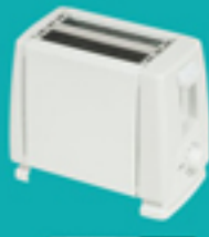
TOASTER 850W QUBA