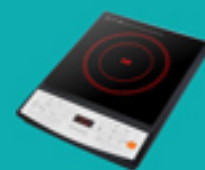
INDUCTION COOKTOP 2000W QUBA