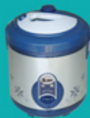
RICE COOKER 1.8L QUBA