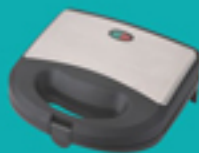
2 SLICE SANDWICH MAKER 1.8L QUBA