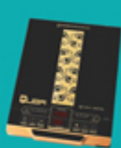
INDUCTION COOKTOP 2000W QUBA