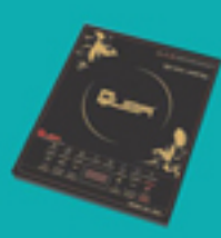
INDUCTION COOKTOP 2000W QUBA