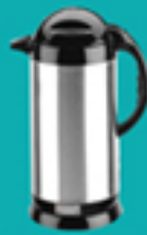
ELECTRIC KETTLE 1.8L 1700W